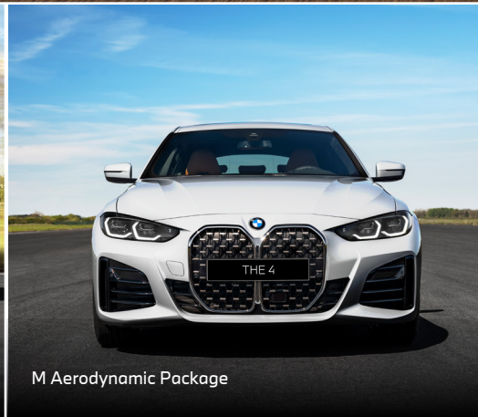
M Aerodynamic Package