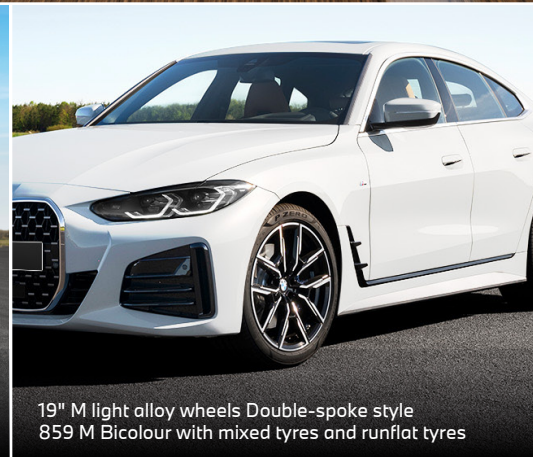
19" M light alloy wheels Double-spoke style 859 M Bicolour with mixed tyres and runflat tyres