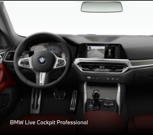
BMW Live Cockpit Professional