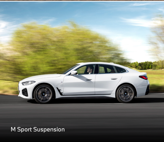
M Sport Suspension

Car specifications may vary from the model shown. Options and features available are model-dependent.