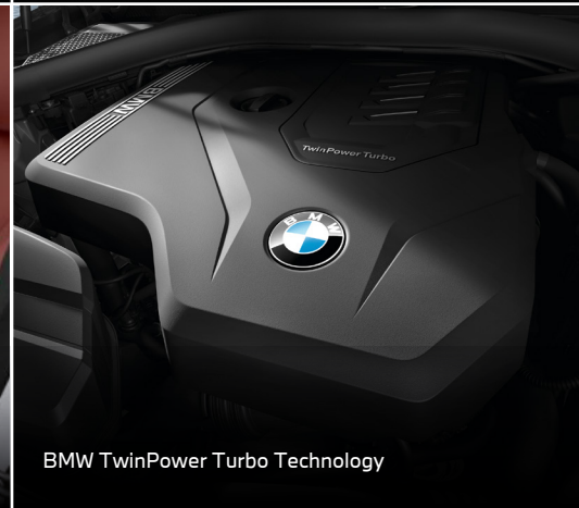
BMW TwinPower Turbo Technology